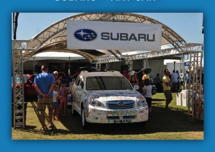
SUBARU - "ART CAR"