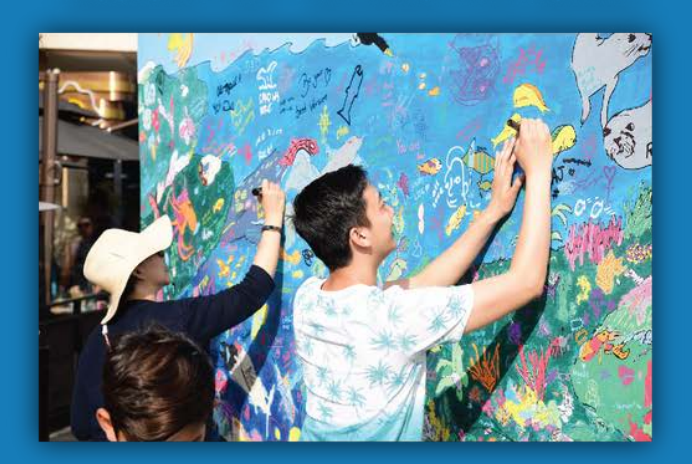
MISSION FED - INTERACTIVE MURAL