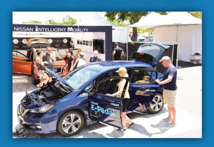
NISSAN - SHOWING & TEST DRIVE