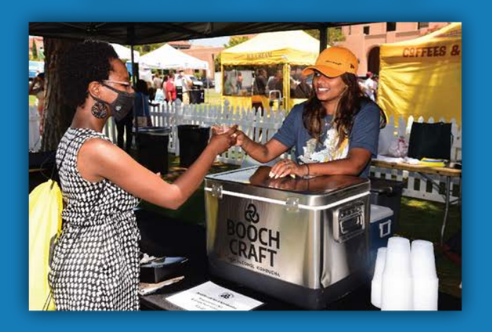
BOOCHCRAFT - 21+ SAMPLING